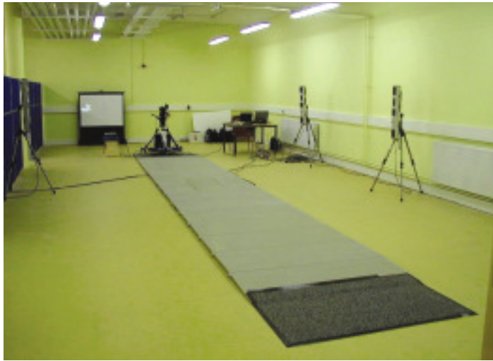
Figure 2: The mobile gait analysis lab "fast and easy to set up for reliable real time data capture".

A first pilot of the mobile gait laboratory was run in early Summer 04 in CRC's centre in Limerick. Limerick was chosen because CRC own a large building in that city from where they provide specialised seating and client