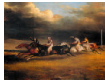
Figure 3: Horse-Racing at Epsom by Theodore Gericault (1821) Louvre, Paris.

In the management of walking disorders, gait analysis has allowed us to replace empirical treatments, such as elongation of the Tendo Achilles, with surgical recommendations based on objective data. Gait analysis is an example of how technological advance has re-defined our scientific knowledge. Historically there have been many difficulties in interpreting motion.